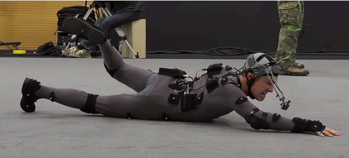
Benedict Cumberbatch as Smaug